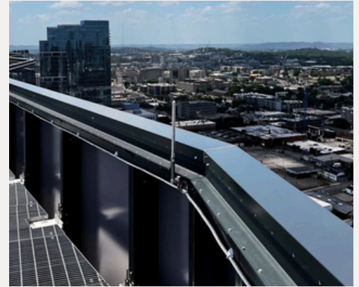
One 22 One Tower - Bonded Lightning Protection Systems, Ltd.