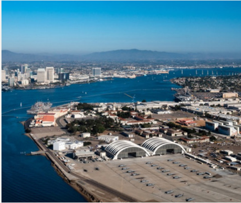
North Island Air Base on Coronado