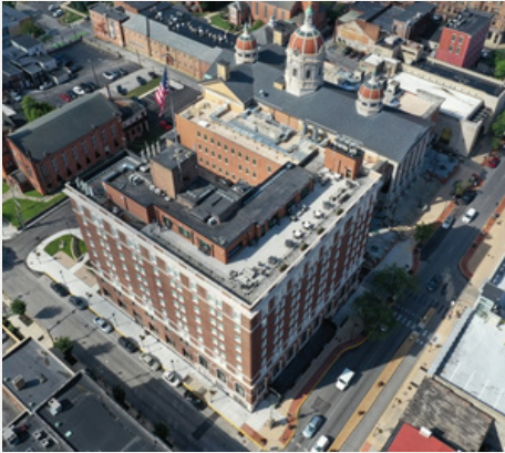
The Yorktowne Hotel - Larson Lightning Protection