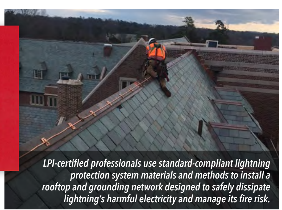
LPI-certified professionals use standard-compliant lightning protection system materials and methods to install a rooftop and grounding network designed to safely dissipate lightning's harmful electricity and manage its fire risk.

Watch and Learn how safety standard compliant lightning protection systems are critical in building lightning safe communities!