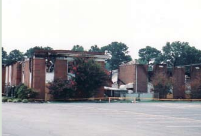
Above: Lightning fires commonly start in the steeple, roof or attic. A direct lightning strike destroyed the entire roof of this church in Mechanicsville, Virginia.

LPI's Master Installer Program is designed to raise the bar for excellence in lightning protection installation and design. When your church contracts with a Master Installer or Master Installer/Designer, you ensure the highest level of instructional excellence for your lightning protection project.