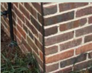
Above (3): Lightning protection elements such as strike termination devices, conductors and grounding are barely visible to the untrained eye.