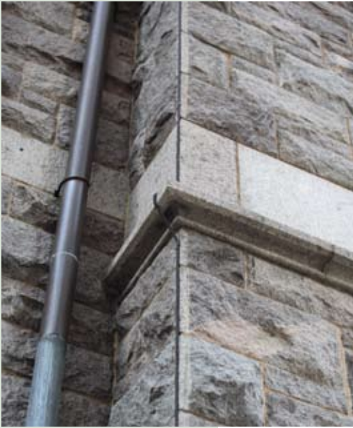
Above: A close-up of down conductor installed for this church shows how inconspicuous lightning protection can be when properly installed.