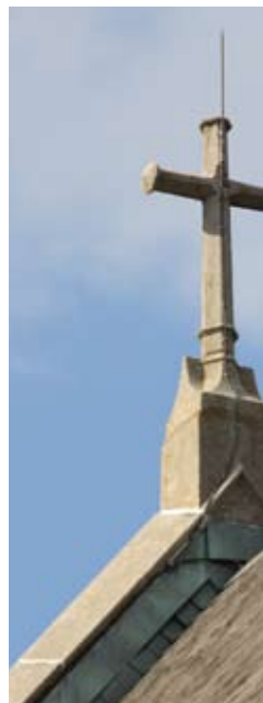
Above: Components must be UL-listed and labeled for lightning protection use.

There is no way to provide “some” protection from lightning—a full system with all elements ( strike termination devices, conductor, bonds, grounding and surge protection ) are essential for a complete and effective system. A trained, LPI-certified lightning specialist will follow